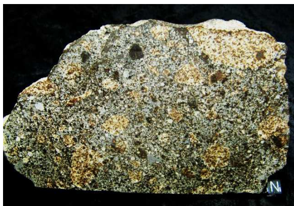
Fig. 1: Typical brecciation texture of NWA 869. Scale cube is 1 cm.

Introduction: NWA 869 represents one of the largest meteorite finds from Northwest Africa. It consists of thousands of fusion-crust individuals from less than a gram up to more than 20 kg. The total mass of recovered material is on the order of 7 metric tons [1]. NWA 869 has been classified as an L4-6 fragmental breccia [2]. Unfortunately, the strewnfield is undocumented and huge amounts of material have been distributed worldwide as unclassified meteorites. The Nomenclature Committee of the Meteoritical Society declares: "Scientists are advised to confirm the classification of any specimen they obtain before publishing results under this name" [2].